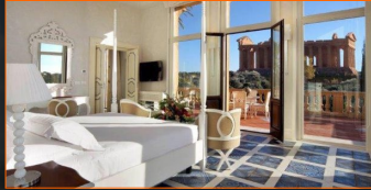
Best luxury hotels selection